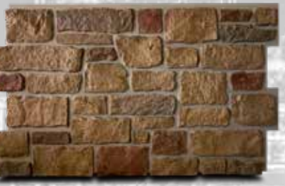
NW CS4830-DR Durango