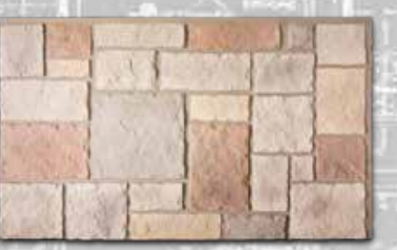
NW CR4830-ST Summer Tan