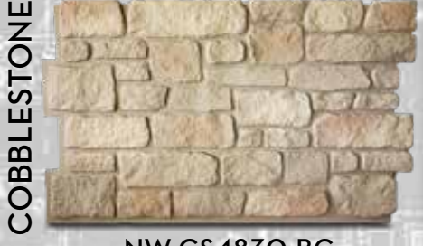
NW CS4830-BG Beige Blend